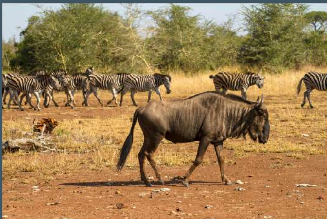
Wildebeest. Wildlife's value will ensure its future on the African plains.

The photo tourism sector is often guilty of siding with animal rights activists in condemning hunting tourism. In an effort to appease tourists, guides will deride hunting during the day but, ironically, serve game meat around the barbeque at night. The Covid-19 vortex has sucked us into the eye of the perfect storm. Revenue for every sector of the wildlife industry has all but dried up, which has had a knock-on effect on conservation efforts. As anti-poaching operations and community upliftment projects falter through lack of funding, rural poverty is escalating, and more and more pressure is placed on natural resources. Wildlife across the continent is under threat like never before. Undermining hunting tourism is a dangerous game; it weakens the viability of conservation as a land-use form. All wildlife use is consumptive, and everyone involved in the wildlife sector should be held accountable for its responsible use. The holistic, sustainable use principle must be embraced and promoted.