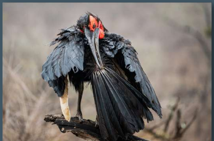
Ground hornbill. We must use a holistic approach to conservation in Africa