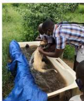
Dipping a young dog at the Centre