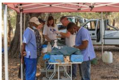
Neutering a dog in the field – thank you Liquorama for gazebo