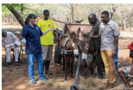
Providing donkey friendly harnesses and education at Jembwe