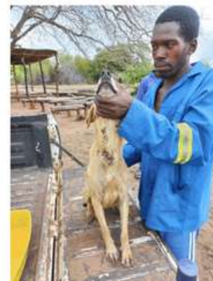
Dog being treated for baboon bites