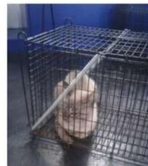
Trapped feral cat waiting for sterilisation and a better life