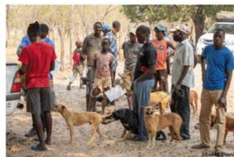
Community members waiting patiently for vaccinations