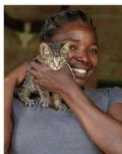
Rescue kitten with foster mother