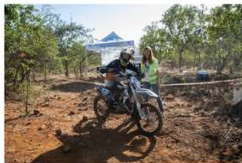
VAWZ VF Time Marshalling at Ken's Crack Enduro 2022