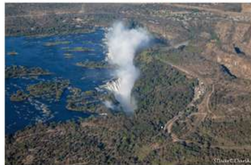
The Victoria Falls