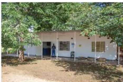
Centre in Ntabayengwe Village