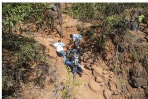
VAWZ Vet and Community Member help a Biker out of Ken's Crack

The on-going covid pandemic, with the ensuing loss of jobs, made life even more difficult for people and their animals, and the funds raised for us by the annual ZMOC Enduro are very much appreciated, especially in a time when fundraising is an extra challenge. That this fundraiser is initiated and run here in Victoria Falls is extra special. The Enduro runs through the area we serve and the local community also assists and can see the benefit of their participation. We thank the ZPGA for their support on this fun and exciting event! Come and watch if you can next year!