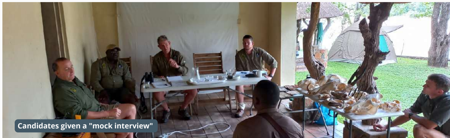
Candidates given a "mock interview"